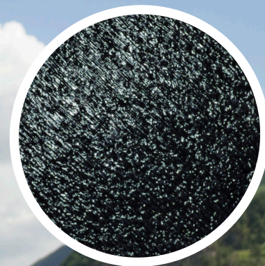
Lower Surface: Thermofusible film